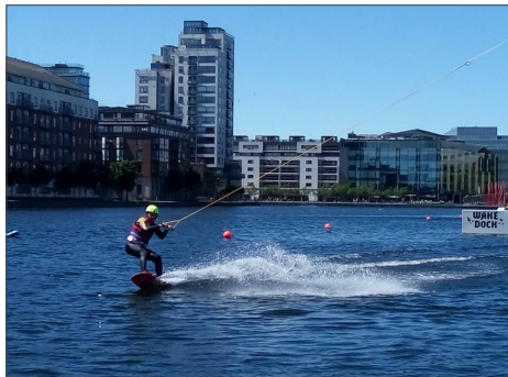
Guidewire employee experiencing wakeboarding lessons with Blueboard reward

Referral Quality and Quantity: During the contest window Guidewire saw a 41 percent increase in the percentage of hires by referral, with referrals making up 25 percent of all hires by contest end.